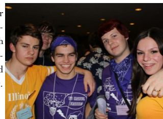
Former IJCLN Officers with IJCLS president and article writer.

There are some experiences that follow us through our lives. Experiences that push up forward and remind us why we love some of the things that we do. This year, I, a Collinsville High School senior, had the pleasure of experiencing my first Latin convention. Lucky for me, it was the State IJCL Convention. During my stay at this convention, I had many amazing, fun, and fresh experiences that I remember fondly. The scale of this convention was enough to blow me away, especially considering how large the hotel was. I can't explain to you the excitement that swept over me and my fellow southern delegates when we entered this glorious building. The board that ran this convention did a very good job with securing such a fine location and making every bit of that building work in favor of the many activities. Our group was kept very busy by said activities. We were almost always on our toes, moving from one place to the other to experience and learn as much as we could, as well as share our knowledge and spirit. There was so much spirit and Latin to see, and because it was Latin, it was all the more interesting. During this convention, I was able to meet many new people and bond with a group of fabulous students who have now become lifelong friends, and I was able to have the time of my life. I will keep the amazing memories of this convention with me for life, and I cannot thank IJCL North for providing such a wonderful experience.